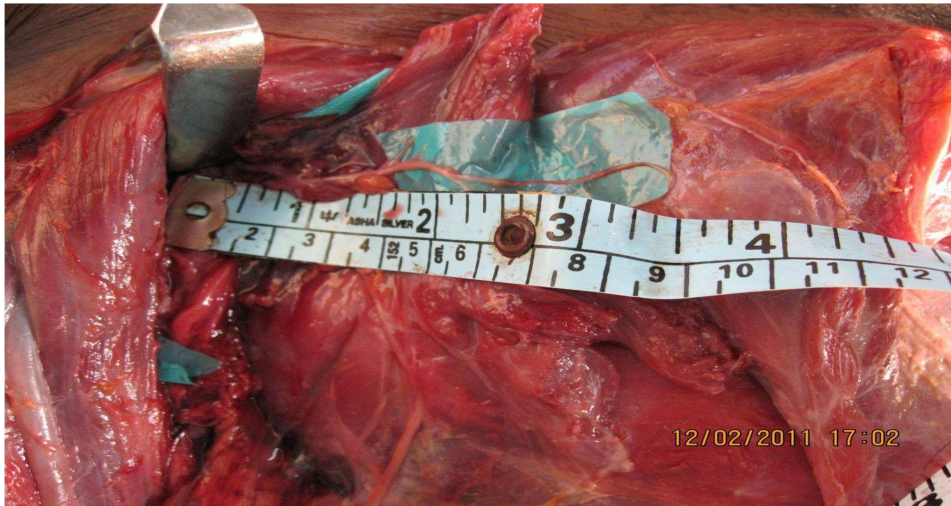
Fig-4: length of medial pectoral nerve approx.8cms

Inclusion Criteria: All the cadavers dissected were male, age ranging from 35 – 60 years