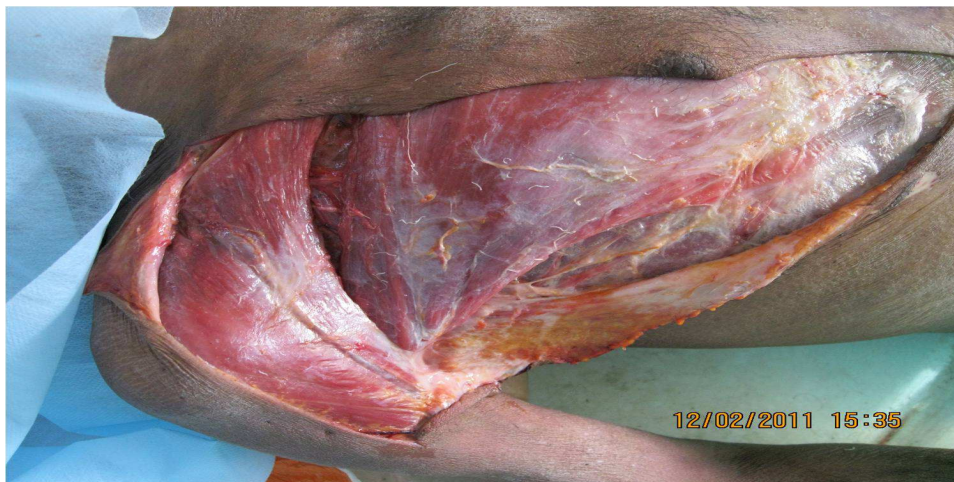
Fig-1: Incision marking

humeral insertion of pectoralis major muscle was transected the medial and lateral pectoral nerves were explored and traced upto their origin from medial and lateral cords.